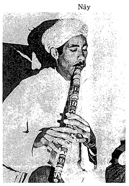
player of the popular nāy (rim-blown flute), Fez, Morocco